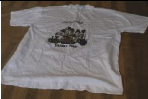
T-shirt med motiv fra Etiopien.