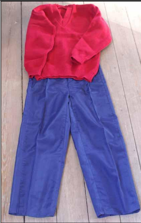
Skoleuniform til drenge.