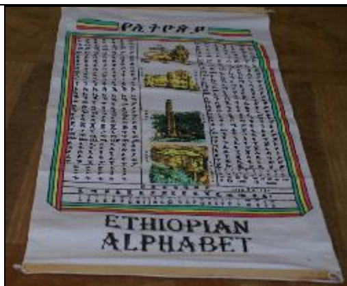
Det etiopiske alfabet på vægophæng.