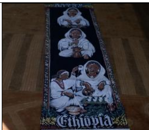
Vægophæng til pynt.